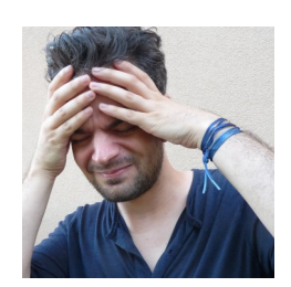
Mental Health Services